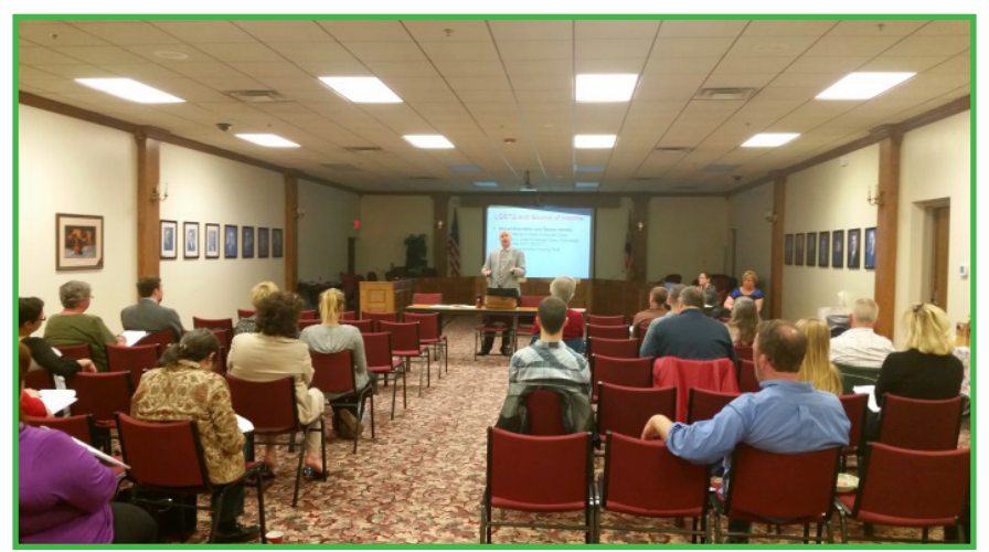
April 2015 - Housing Coalition Fair Housing Training

Staff gave presentations on Fair Housing and Landlord/Tenant laws before a number of township trustee/council meetings and other meetings during the year and distributed brochures at public buildings and agency offices. In April, Fair Housing Month, RPC staff assisted with the coordination of a Fair Housing Training with our county's Housing Coalition. The RPC staff also provided a training session to the Fairfield County Landlords Association in June 2015.