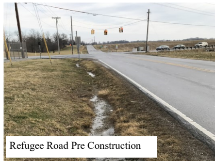
Refugee Road Pre Construction

This project is just the first phase of a larger project to address accidents and safety in this corridor. The County, along with the Fairfield County Transportation Improvement District, is looking at a larger "Complete Street" project along the corridor from the existing multi use path and sidewalks at SR256 and connecting through to the Tollgate Road Middle School at the intersection of Refugee Road and Tollgate Road. The planned multi use path and sidewalks will fill a much-needed void for active transportation within this community. The county plans to pursue, as part of the next phase, implementing these improvements to provide safe active transportation in this corridor.