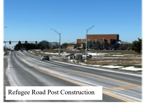
Refugee Road Post Construction