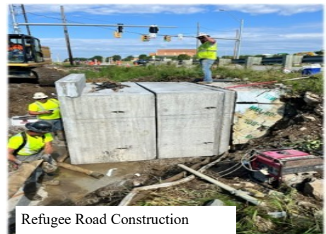
Refugee Road Construction