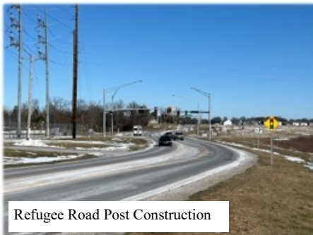
Refugee Road Post Construction