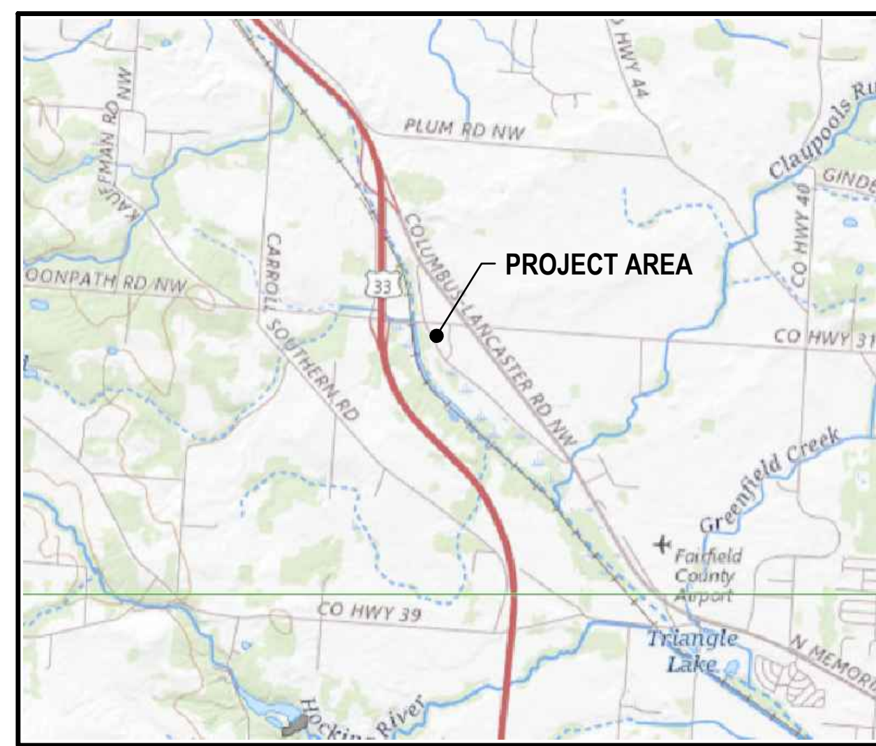
LOCATION MAP NTS