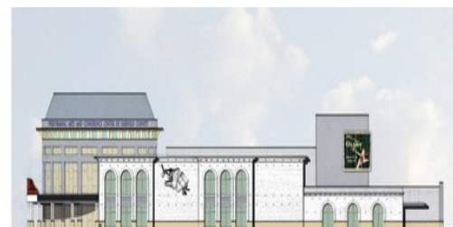
Artist Rendering of Proposed Center

PACFC P.O. Box 332 Lancaster, Ohio 43130