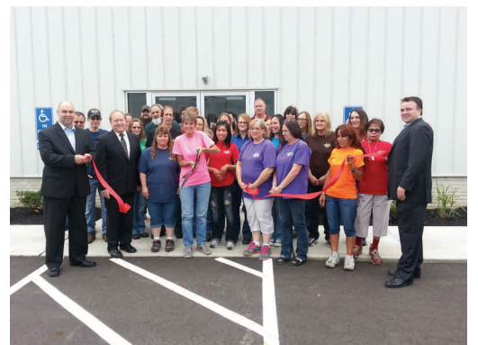
Phoenix Electrotek employees at ribbon cutting ceremony