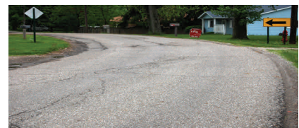
Oberle Ave. to be widened

For more information on this grant or other CDBG programs, please contact the Fairfield County RPC at 740-652-7110.