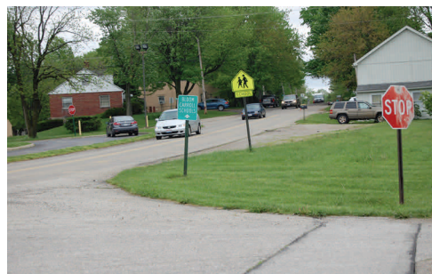
High Street view (facing east) will get new sidewalks